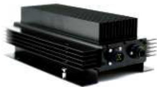
COTS Rectifier, Converter & Inverter Power Modules