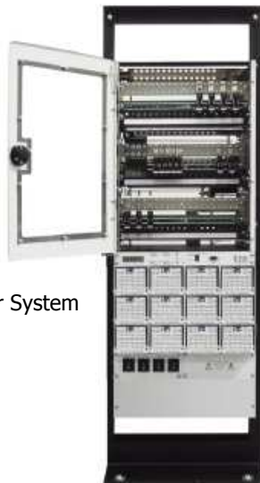
COTS Configured Power System